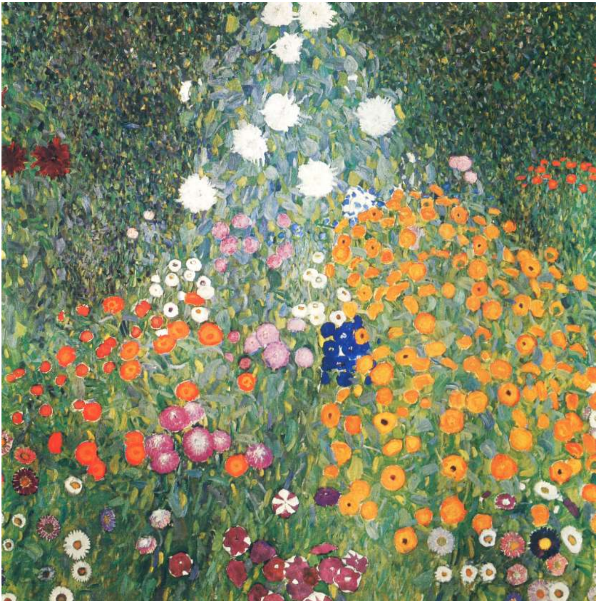
"Flower Garden" by Gustav Klimt