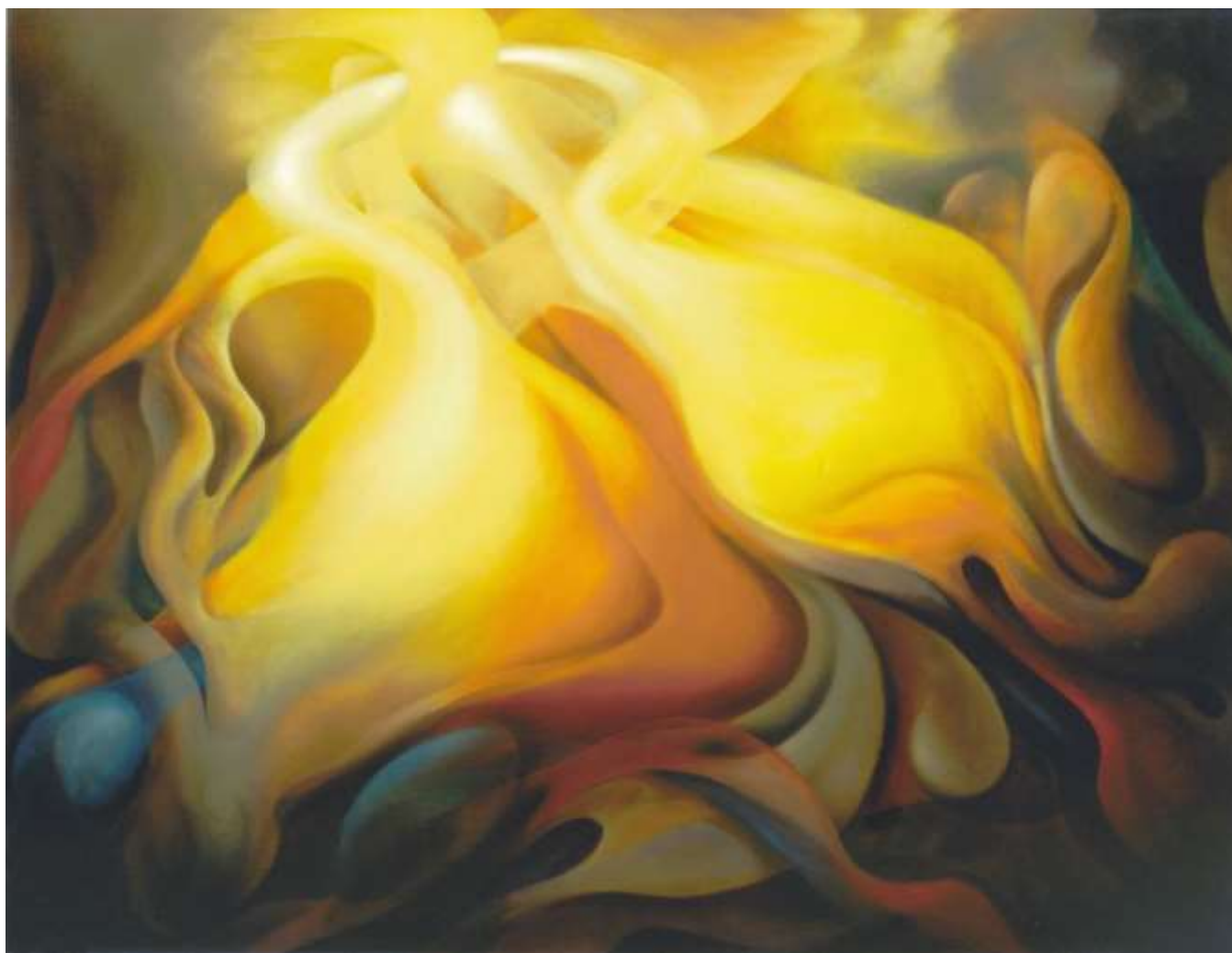
"Transfiguration of Jesus" by Armandu Alemdar Ara