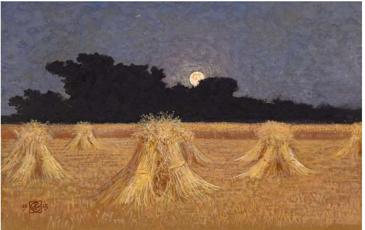
Moonrise by Walter Crane "The harvest is plentiful..."