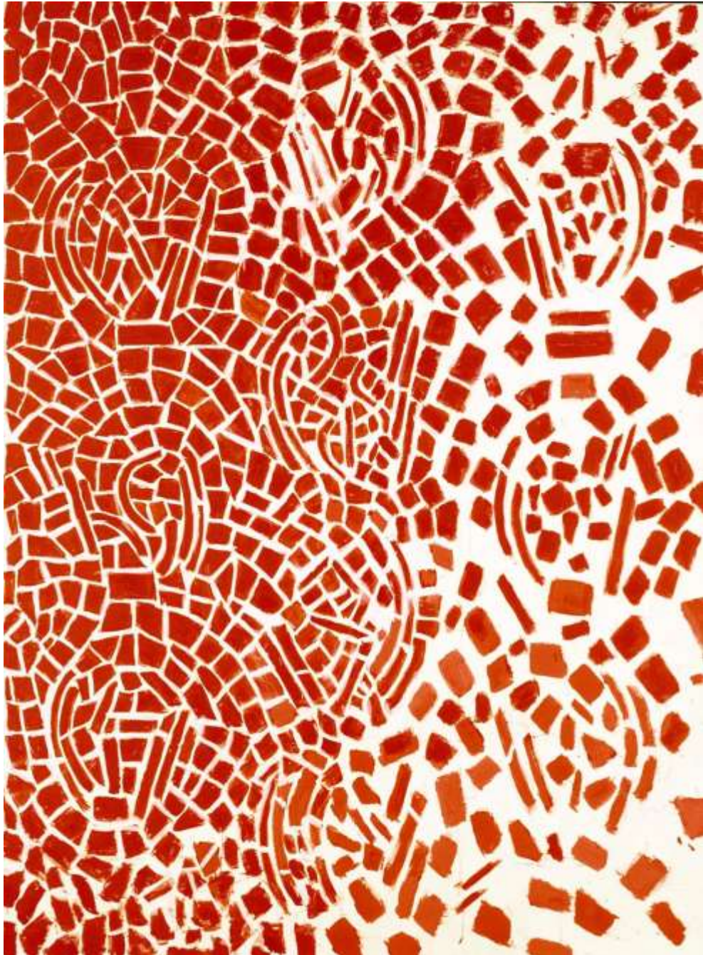
"Music" by Alma Woodsey Thomas