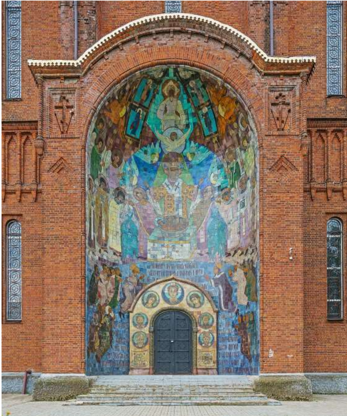
Maiolica Mural at Resurrection Church by Masters of Abramtsevo Colony in Vichuga