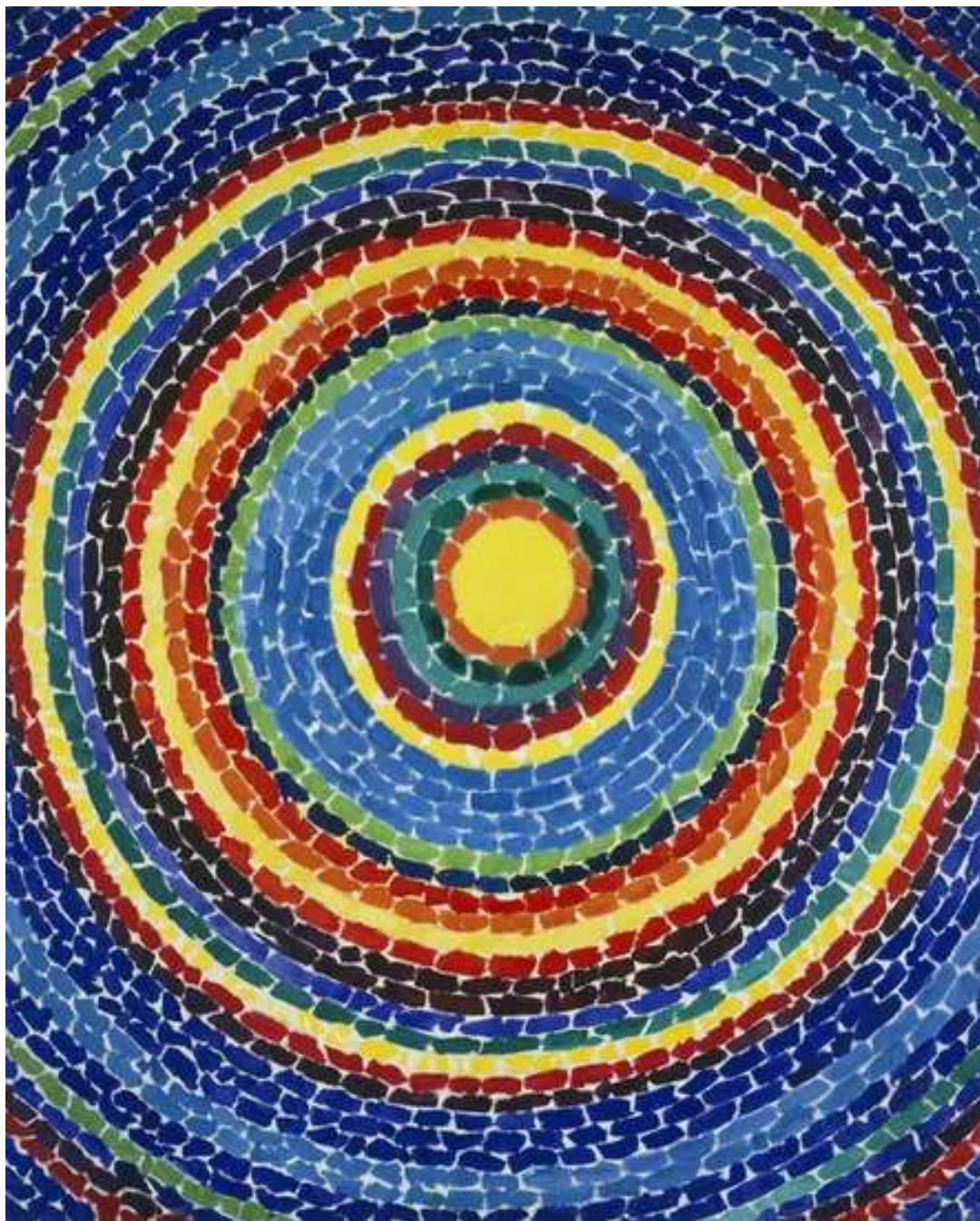
Resurrection by Alma Woodsey Thomas