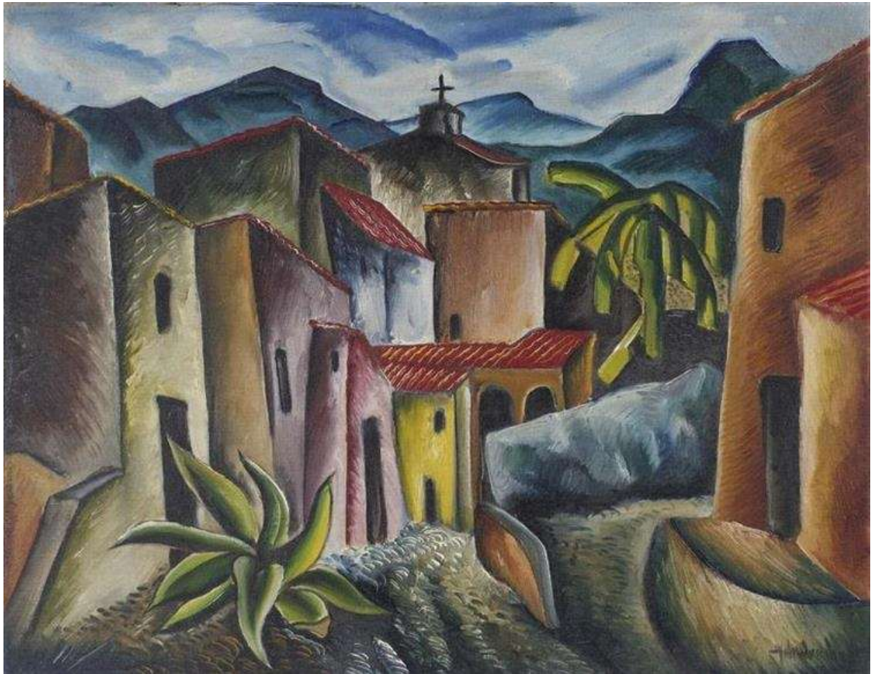
San Miguel Allende by Hale Woodruff