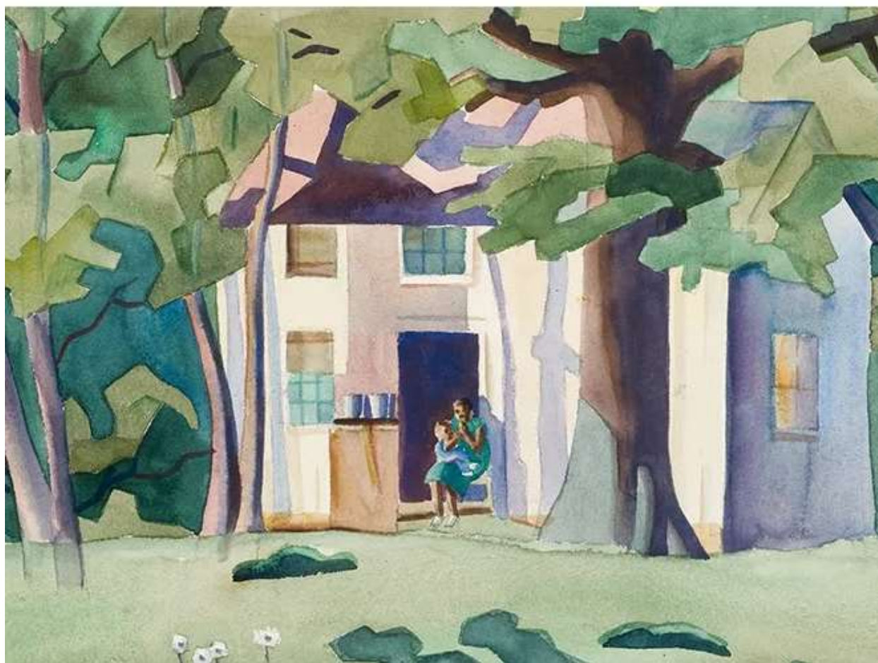
“Sedalia, North Carolina” by Lois Mailou Jones