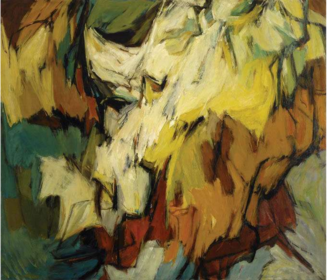
"Return to Europa" by Hale Woodruff

"This sanctuary called Earth, is filled with God, quivering in the forests, vibrating in the land, pulsating in the wilderness, and shimmering in the rivers."