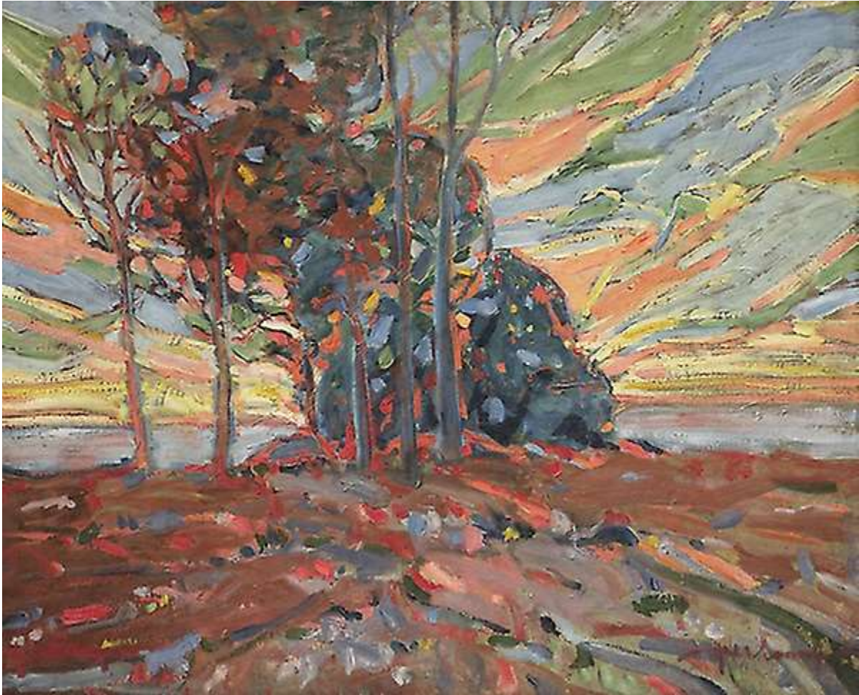
"Twilight" by Hale Woodruff

"They are like trees planted by streams of water, which yield their fruit in its season, and their leaves do not wither." Psalm 1:3