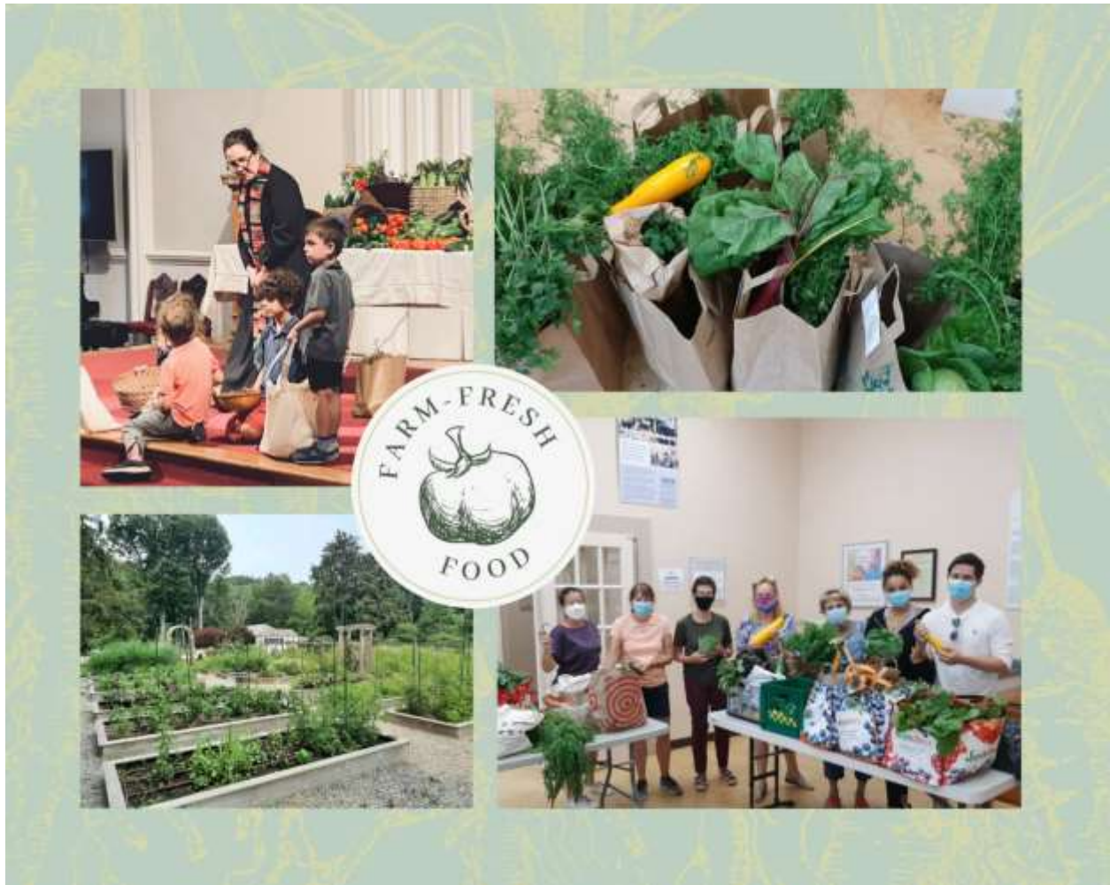
Members worked on Intergenerate gardens and collected fresh food for distribution to Neighbors Link!