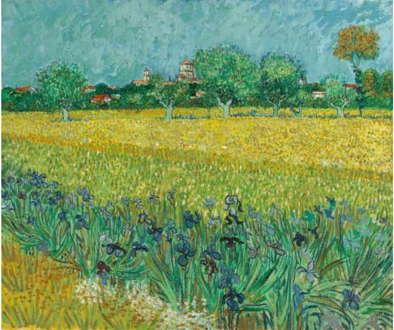
Field with Irises near Arles – Vincent van Gogh