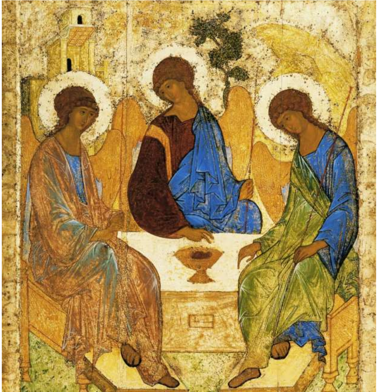
"Angels at Mamre Trinity" by Andre Rublev