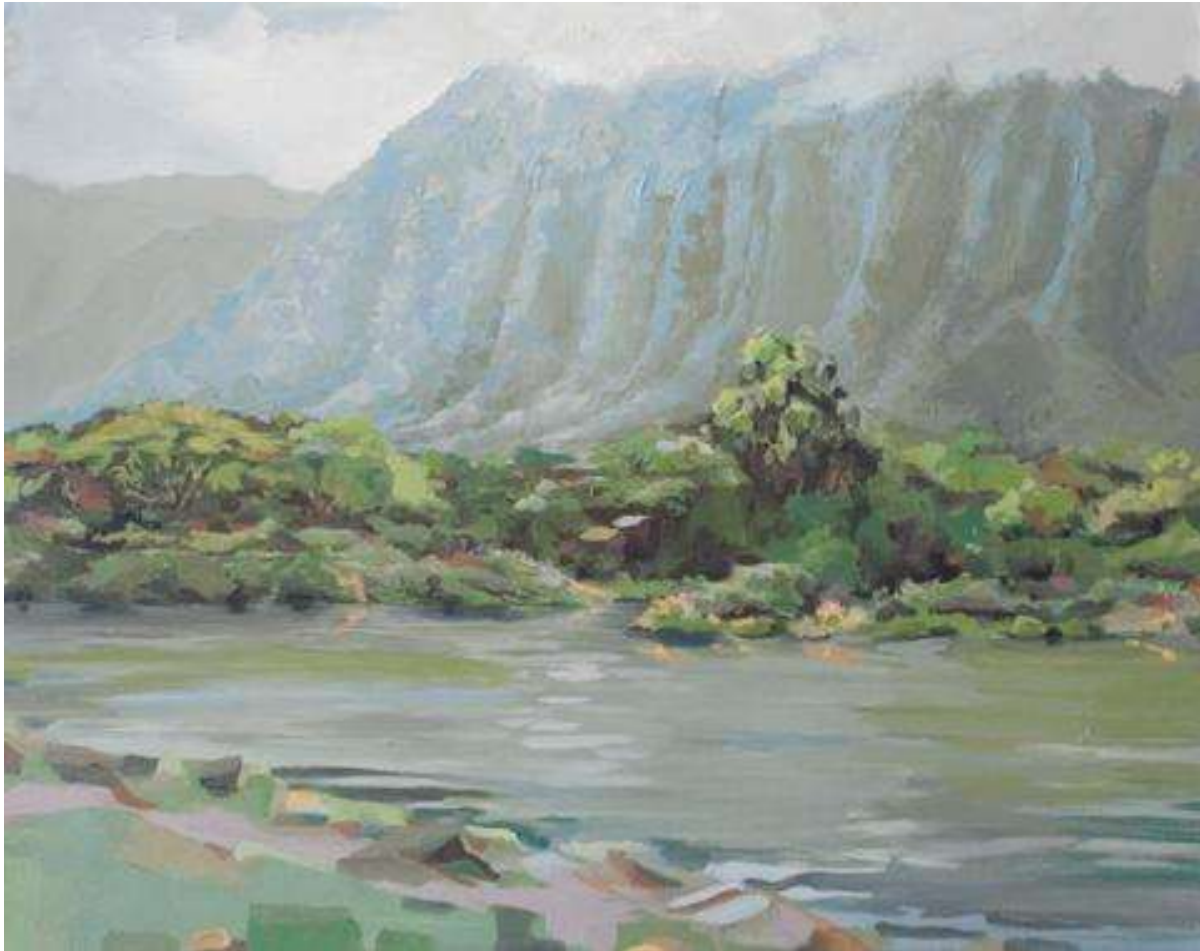
Ko'olau Mountains from Ahuimanu