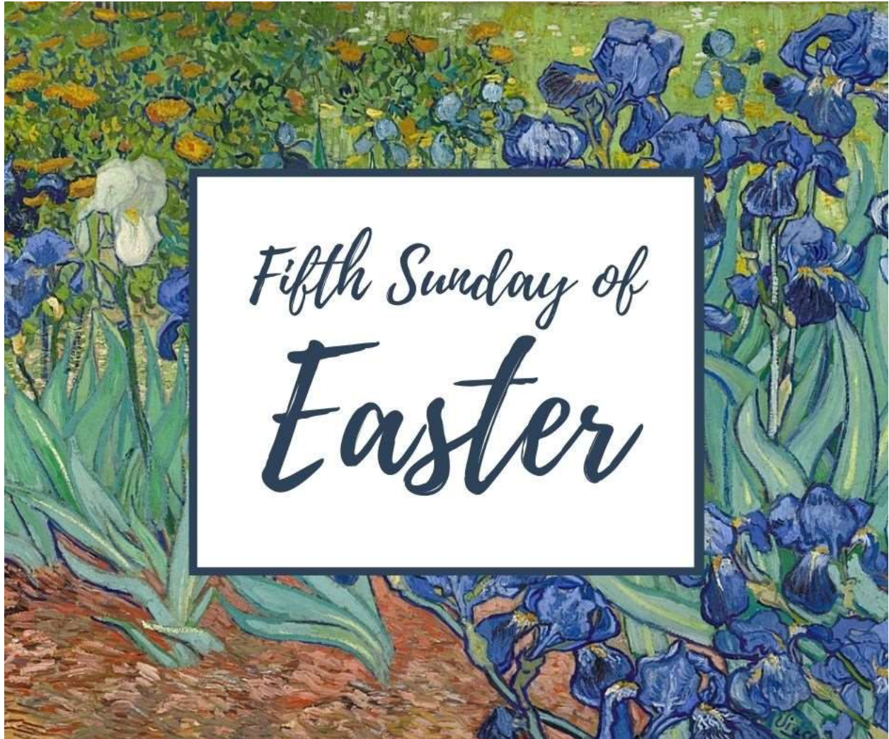
"Iris" by Vincent Van Gogh