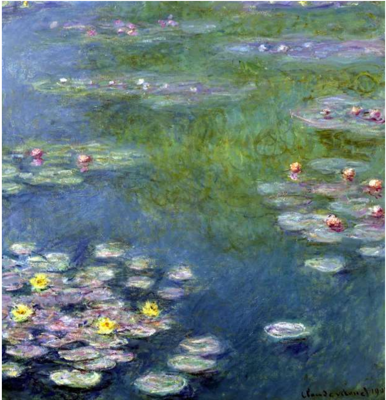
"Water Lilies" by Claude Monet