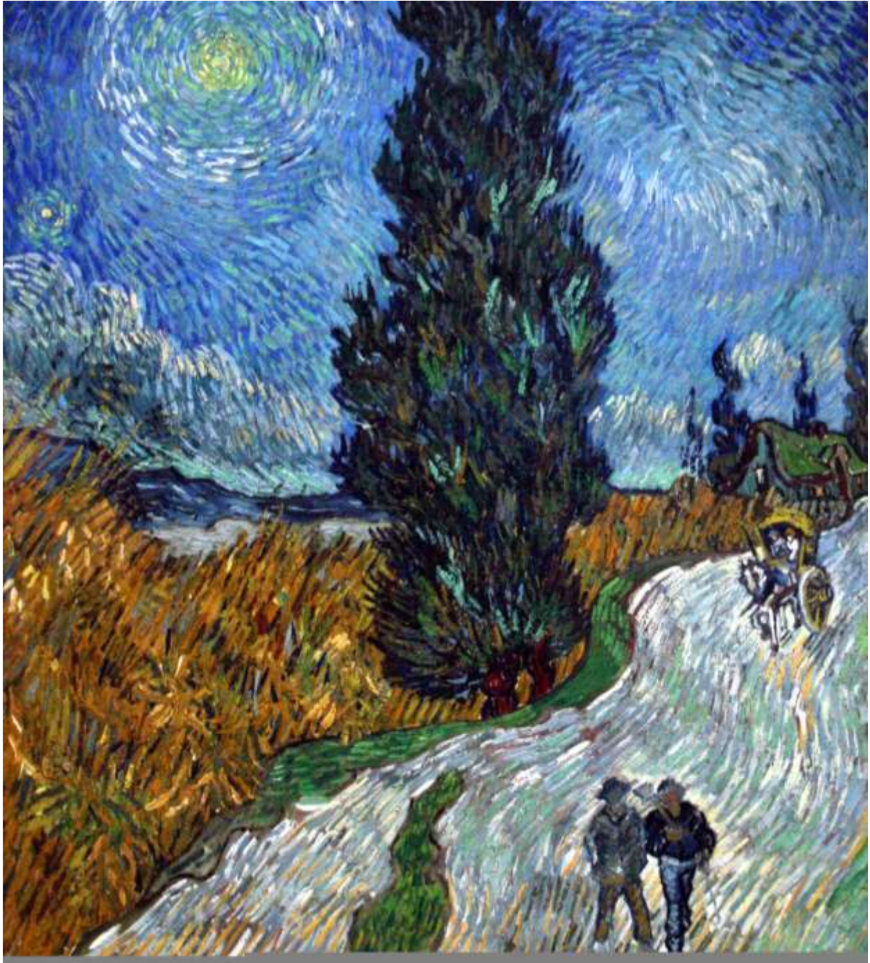
"Country Road in Provence By Night" by Vincent Van Gogh